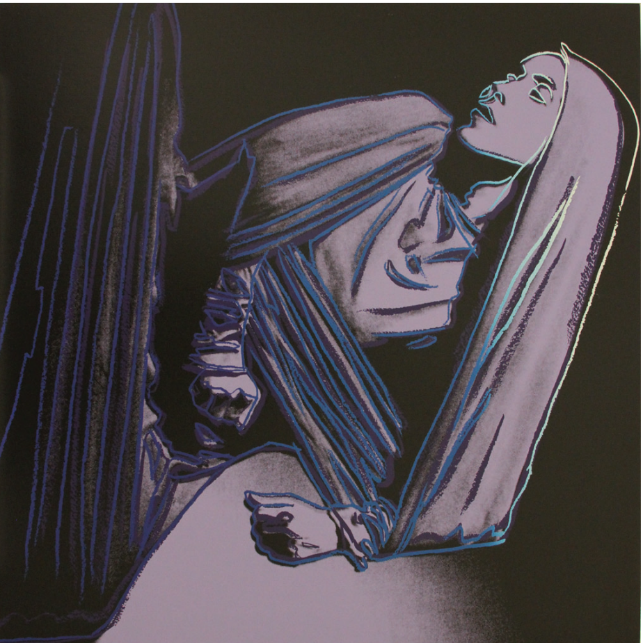
Andy Warhol (American, 1928–1987), Martha Graham (Lamentation) , 1986. Screen print on Lenox Museum Board, 36 x 36". Gift of the Andy Warhol Foundation for the Visual Arts, Inc., 2014 © The Andy Warhol Foundation for the Visual Arts, Inc. / Artists Rights Society (ARS), New York.